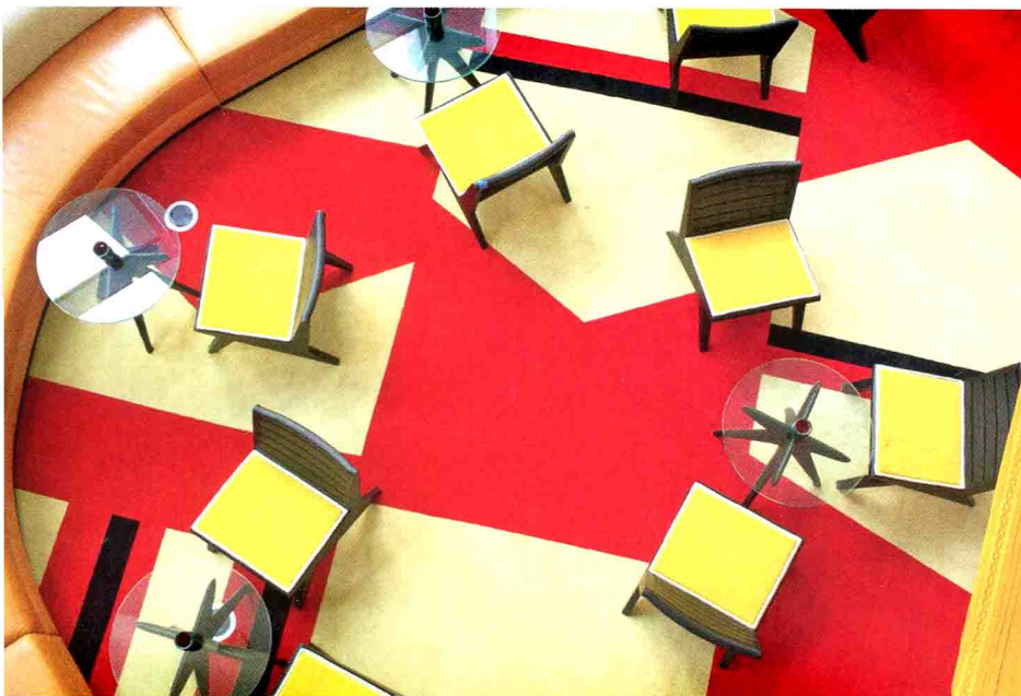
The Durham's lobby, seen from the mezzanine balcony.

The season's colorful patchwork patterns, updated florals, and earth tones befit North Carolina's newest design star.